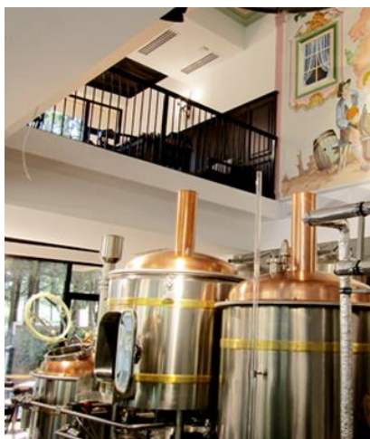
FLECKS Classical Pub brewery 3-5-10-20 HL