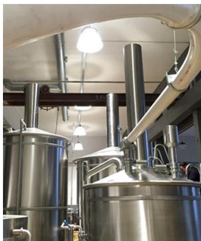
FLECKS Craftbrewery Production 3-5-10-20-30-50 HL