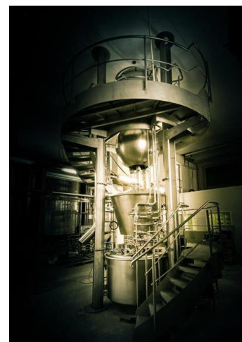
FLECKS HELIX Designer Piece 5 HL

Configure your own brewery with the help of this price list: